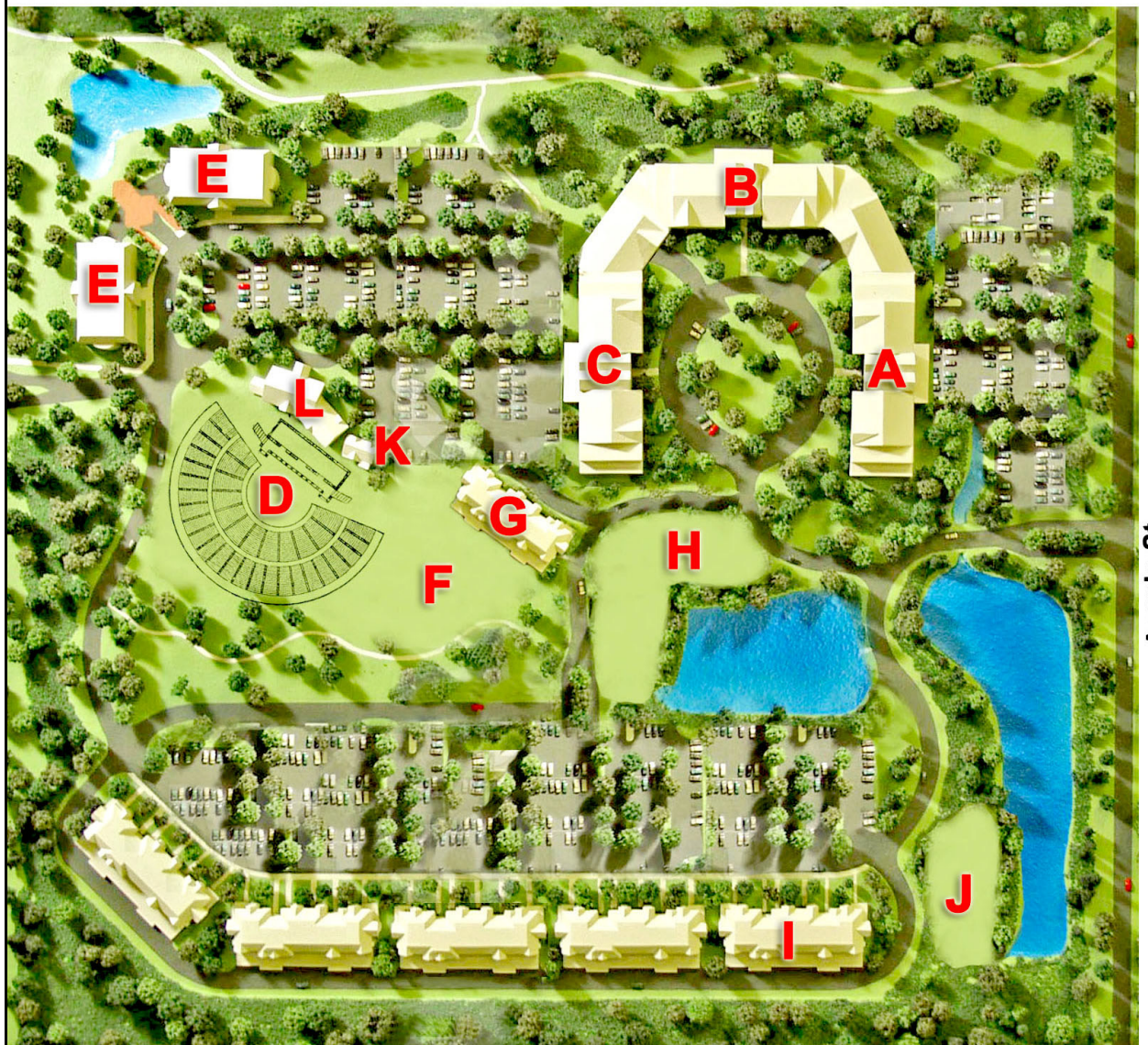
Thistlemoor Dr. Area

The current DCE site (shown to the right from Google Maps) cannot be allowed to sit for another 5, 10 or 20 years as an empty pit that is an economic drain on Haldimand. It cannot remain a symbol of what divides people but must become a symbol of the future and prosperity. Bold leadership is needed to think outside of the box, that dares to believe something positive can come from all that has happened. We believe that a STRONG Haldimand Council can and will produce positive benefits for the people of Haldimand.