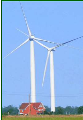
Photo: Enbridge Wind Farm, Kincardine, Ontario

Although windmills are 1500ft away from homes, you can see that these windmills alter the landscape. Of the 140 homes within 3kms of Clear Creek, Ontario wind farm there are now 40 that are abandoned, vacated or up for sale. Not one home near windmills on Wolf Island has sold since 2006. Recently Sutton Realty Group tracked the sale of 600 homes near windmills. Their conclusion was that any home within 3kms would sell for an average of $48,000 less than homes outside the 3kms range.